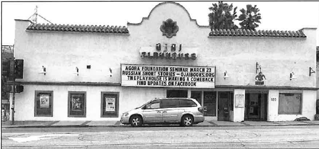
Figure 17. Façade of the Ojai Playhouse Theater in March 2019, facing south.