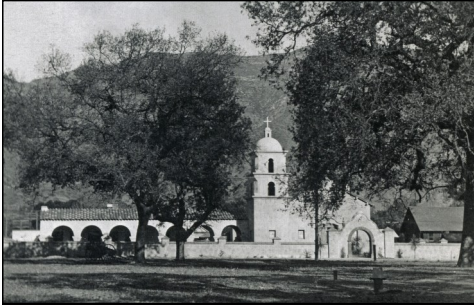
St. Thomas Aquinas Church