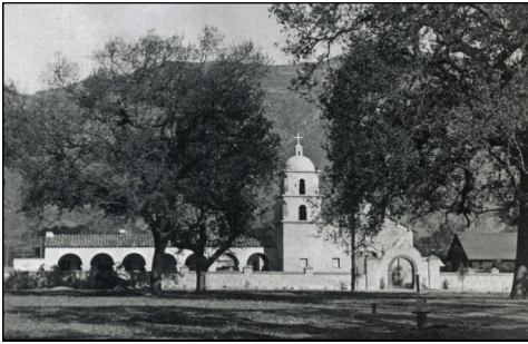
St. Thomas Aquinas Church